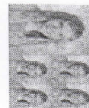
1-5x7 + 4 Wallet: